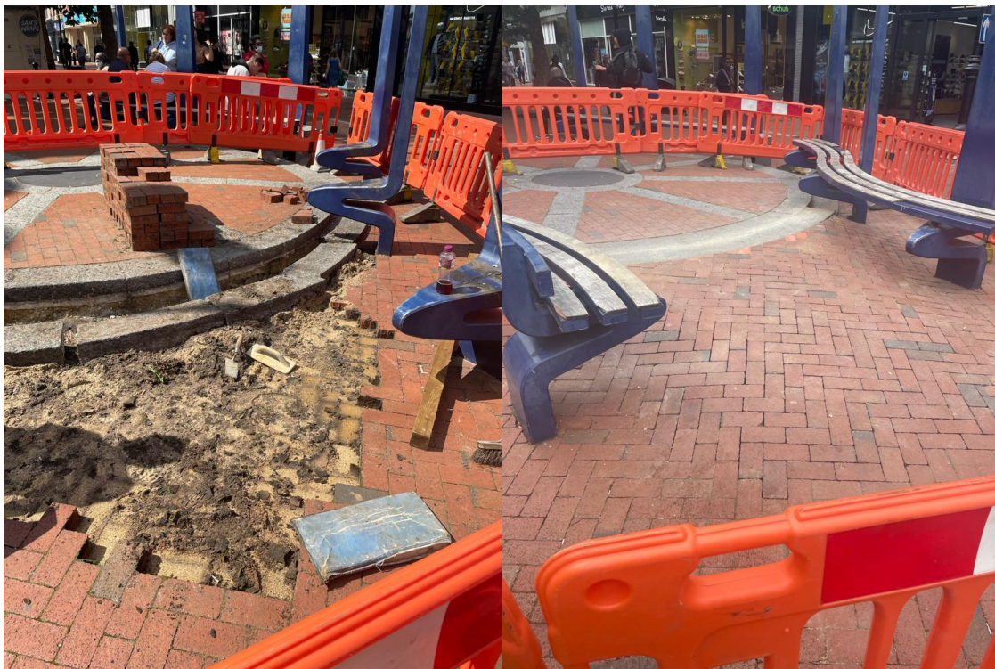
Broad Street Seating Area (during works) After Works

6 additional pedestrian dropped crossings are shortly to be installed at outlying shopping areas as part of this fund.