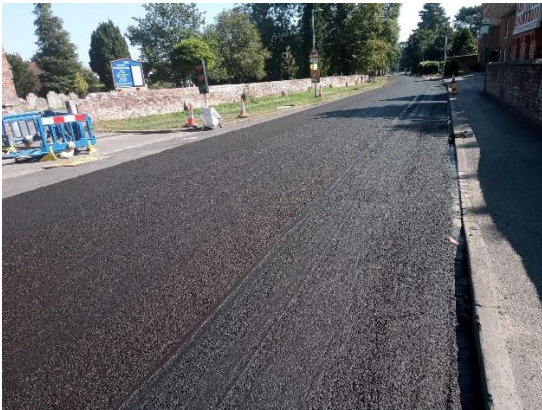
New Lane Hill