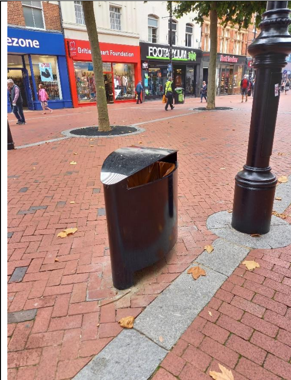
Litter Bin Refurbishment & Column Painting