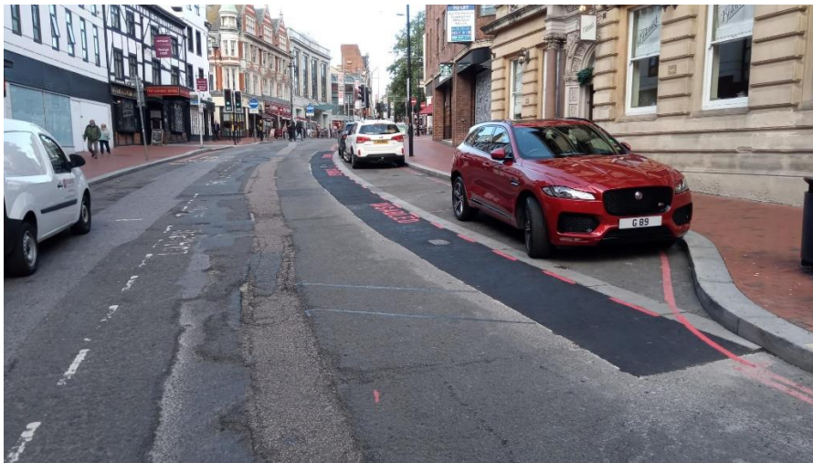
Kings Road Disabled Parking Bay

And finally, we plan to deliver up 400 more Residential Roads and 20 more Pavement schemes during Year-3 (2022/23) starting in Spring 2022.