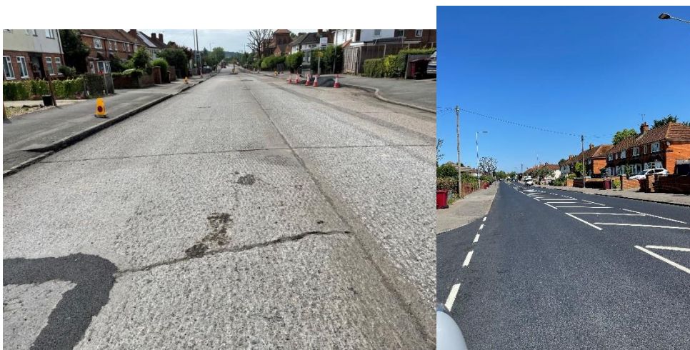
Northumberland Ave Before & After